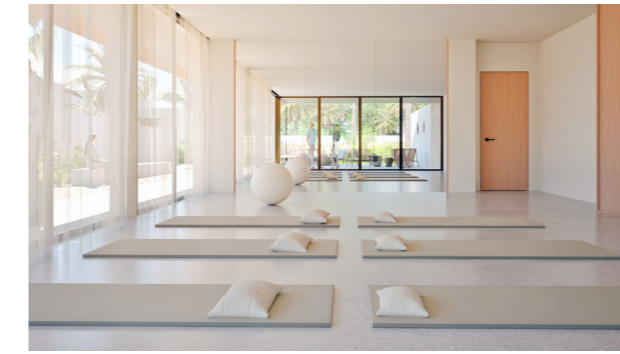
Yoga & Meditation Area